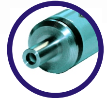
Ferrule 2.5 mm